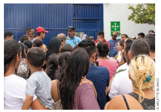
Migrants are exposed to danger in Reynosa, Tamaulipas, Mexico

"There is a lot of crime. We already have been through years on the move. We were living in Guatemala and migrated to Mexico, because there is also crime in Guatemala. When we crossed the river into Mexico, they seized us and deported us. When [later] we arrived in El Salvador, [the gang] asked us for 'rent' because we hadn't lived there before. So we had to pay, because if you don't pay, they come for you. People suffer a lot by having to run away from our country. Now I don't have anywhere to go in El Salvador; I sought asylum but they rejected me. I had no alternative but to leave and walk. We arrived in La Venta [Mexico], and there the migration authorities beat us. A human rights organization took photos of the wounds on my back. We are looking after each other. We have crossed mountains, passed through dangerous places, traveling by other ways; we have jumped onto moving trains, although they say that on the train you run the risk of being kidnapped or attacked. There are some people who lost parts of their body while trying to get onto the train, but we don't have any other choice. We have to migrate in order to be able to live a little better".