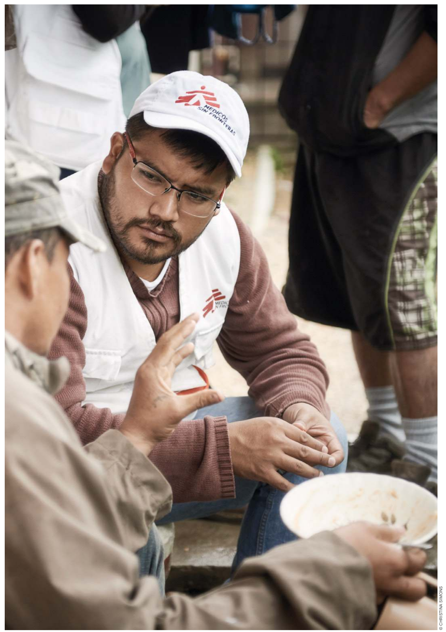
MSF provides medical attention and mental healthcare in Coatzacoalcos, Veracruz, Mexico.