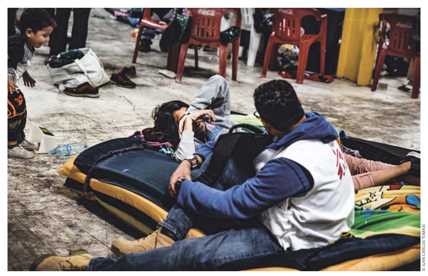
In February 2019, an MSF team worked in Piedras Negras (Coahuila, Mexico), following the arrival of a caravan of 1,700 migrants.