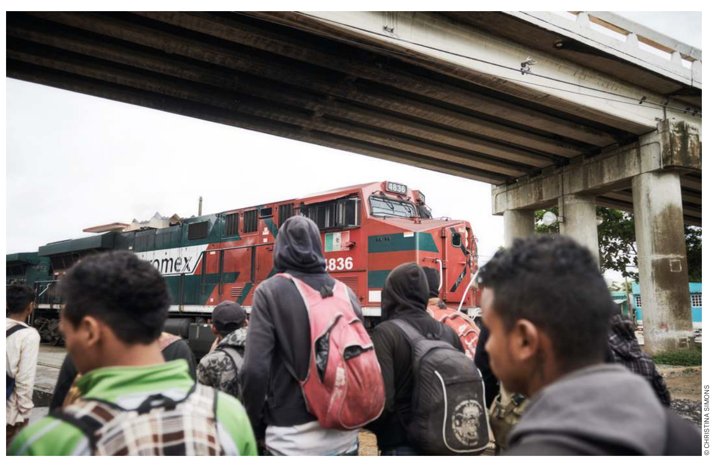
Migrants and refugees gather by the main bridge in Coatzacoalcos, Veracruz, Mexico, to prepare for their journey north on the cargo train known as La Bestia (The Beast).