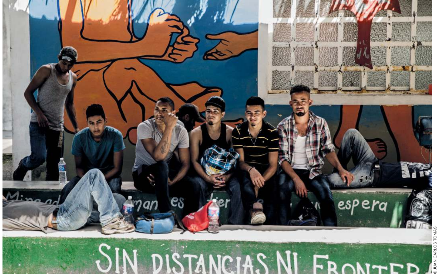
Migrants and refugees wait to register at La 72 shelter in Tenosique, Tabasco, Mexico.