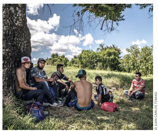
A group of migrants rests after crossing the border from Guatemala into Mexico, near La 72 shelter in Tenosique.

The criminalization of migration has been accompanied by reports of inhumane treatment in detention centers. Many of MSF's patients in Mexico report having been detained in deplorable conditions in the US, 2 sometimes in frigid cells (described in Spanish as hieleras, or "freezers") for weeks on end, 3 with the lights turned on 24 hours a day, with limited access to health care, and without adequate food, clothing and blankets.