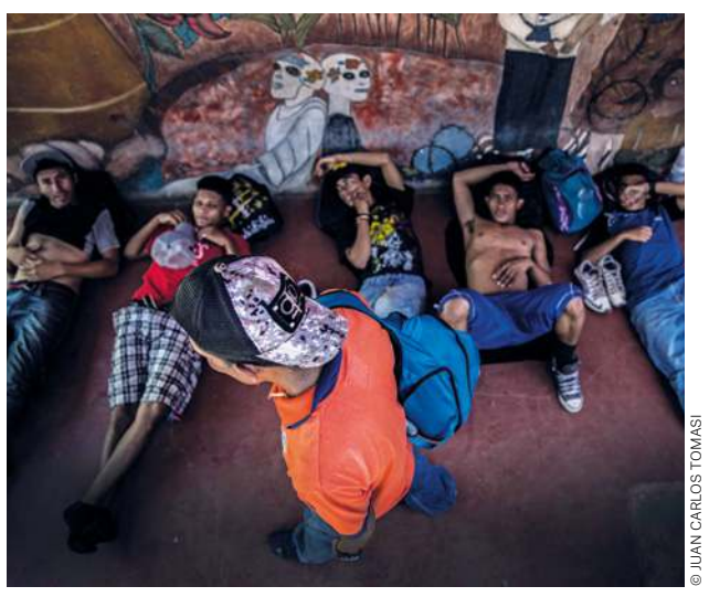
La 72 shelter in Tenosique, Tabasco, Mexico.

21 days and it's unbearable to see so many people, so many women with their children.... Being here is the most horrible thing that has happened to me in my life. You can't do anything, the heat is unbearable. People are crying and screaming, they're in despair, and you can't do anything. The children are not eating, but who is going to eat this undercooked, rotten food? Not to mention the stench from the restrooms.... None of the workers look you in the face; I believe it is because, if they look at you, they would see the suffering, that we aren't being held in suitable conditions. This is sad, inhumane and disgusting. There isn't any water. I have only had a wash three times in 21 days. My children have rashes from the sweat and dirt. I can't go to the toilet because they are overflowing, and the stench overpowers everything. Sometimes I think this is hell, and when I think that, sadness washes over me and I can't stop crying. My babies look at me and hug me, and I realize they are crying too. What can I do? Now I want to see my husband and tell him that we won't wait any longer, that they can deport us if they like, but let us out of here now. If they are going to kill us, we would at least be seeing the sky, feeling the air, feeling free. But I don't want to die of sadness and loneliness here —worse than an animal, worse than anything, worse than nothing".