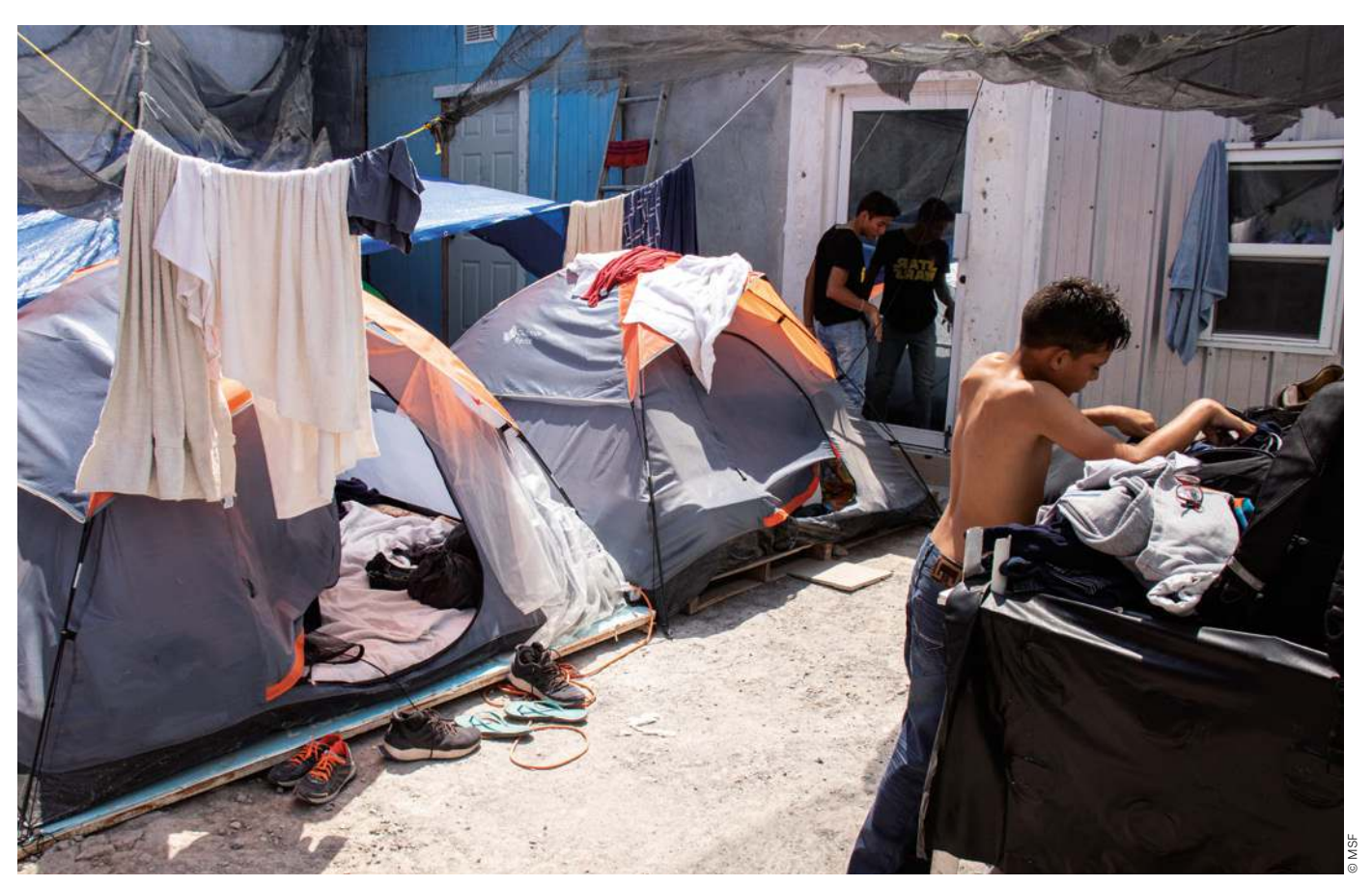
Asylum seekers sent back to Mexico by the US are living in a makeshift camp by the international bridge between Matamoros, Tamaulipas, Mexico, and Brownsville, Texas.