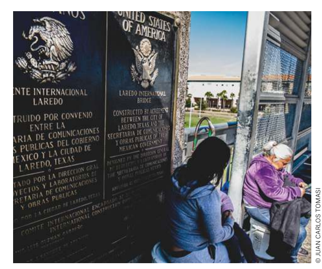
Asylum seekers wait at the international bridge between Nuevo Laredo, Tamaulipas, Mexico, and Laredo, Texas, to apply for protection in the US.

Requiring asylum seekers to apply for protection in unsafe countries —in many cases, countries with