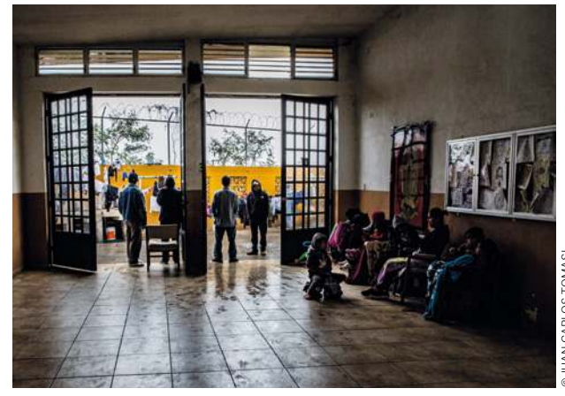
MSF offers medical, psychological and social work services in Nuevo Laredo, Tamaulipas, Mexico.

In June 2019, Mexico signed a joint declaration with the US pledging to "take unprecedented steps to increase enforcement to curb irregular migration, to include the deployment of its National Guard throughout Mexico, giving priority to its southern border. Mexico is also taking decisive action to dismantle human smuggling and trafficking organizations as well as their illicit financial and transportation networks". 112 This followed US ultimatums pressing Mexico to take immediate action to limit the flow of migrants moving north, including a threat to impose tariffs on all Mexican goods.113 Since then, the situation has worsened. In June, MSF teams witnessed raids and mass apprehensions at our health care posts in Tenosique and Coatzacoalcos<sup>114</sup>. Such harsh measures force migrants and refugees into hiding and block their access to basic services such as medical care.