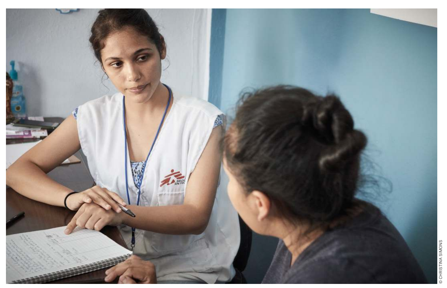
Consultation in Reynosa, Tamaulipas, Mexico.