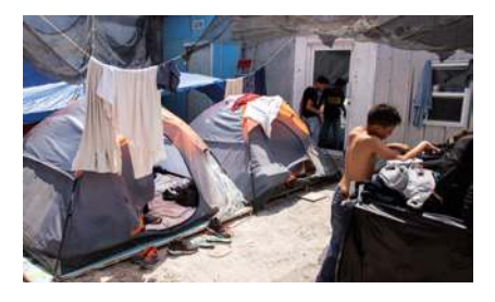
COLLAPSE OF THE REGIONAL SYSTEM FOR PROTECTING MIGRANTS AND ASYLUM SEEKERS