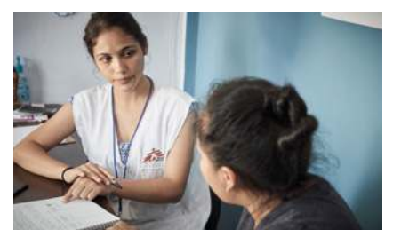
CALL TO ACTION