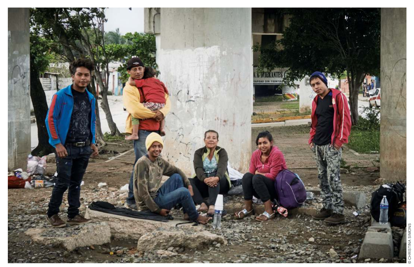
A Honduran family travelling north makes a stop in Coatzacoalcos, Veracruz, Mexico.