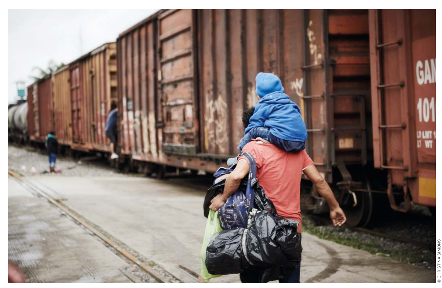
In recent years, MSF teams have seen an increase in the number of women, children and families making the journey north.